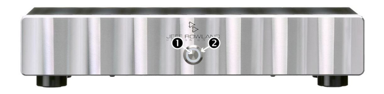
Figure 1: Front Panel