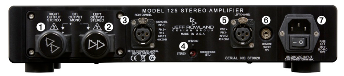
Figure 2: Rear Panel Connections