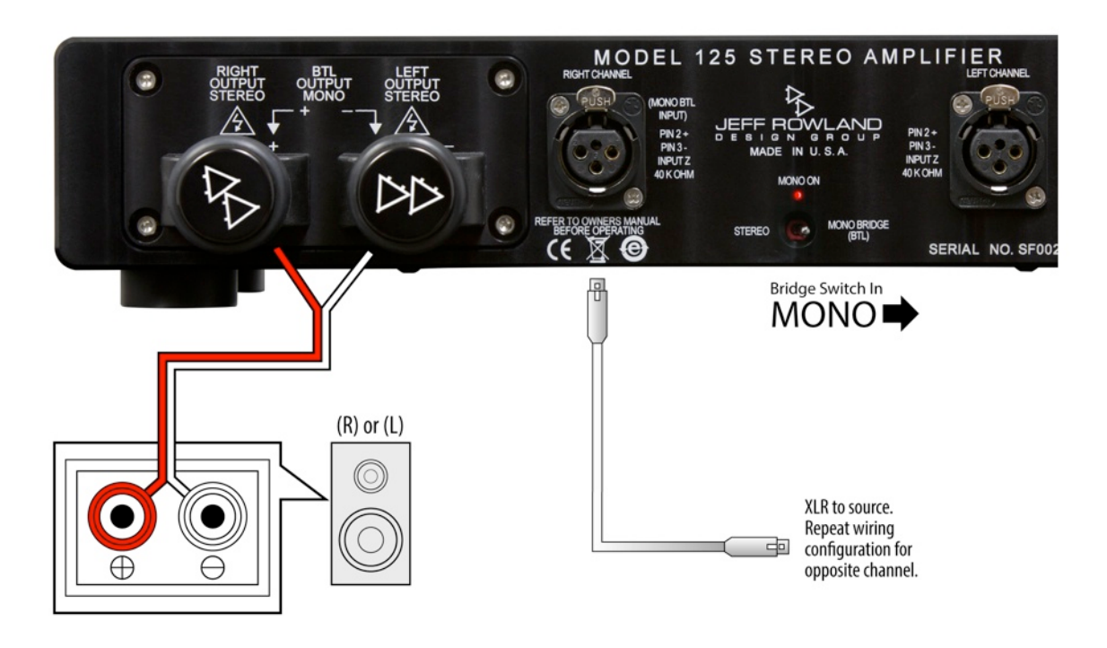
Figure 4: Bridge Mode loudspeaker connections